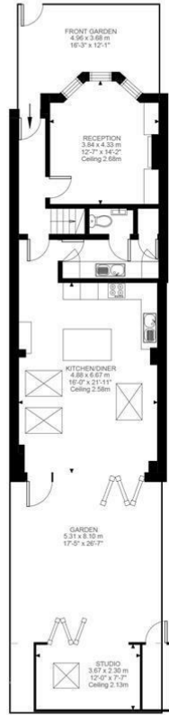
Ground Floor 697 ft 2